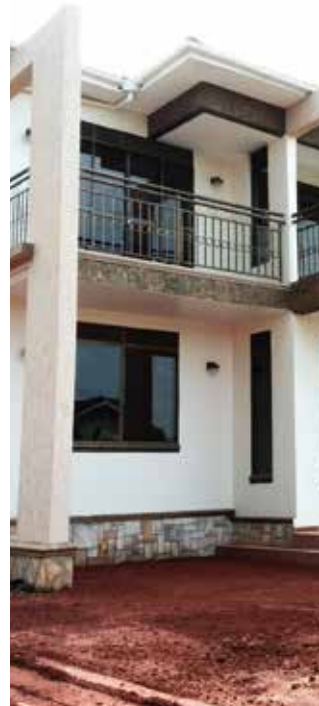
REMITTANCES FROM ABROAD (RFA) AS PER BANK OF UGANDA

Uganda's economy has recovered momentum, growing at over 6% per annum over the last two years according to the Annual budget 2018-2019. This also reflects in the contribution through Remittances from Abroad (RFA) as seen below